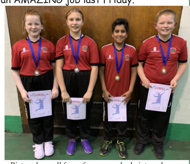
Pictured are all four of our super badminton players

Both boys and girls teams were playing in the finals and they performed superbly. The girls came second in all the schools in Rossendale and the boys came first! Miss Westerman said they all tried their very best and also behaved perfectly - Well done! - a credit to the school!